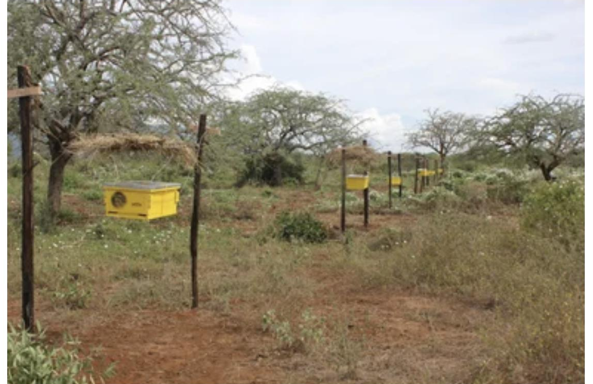
Beehive fence protects farm from elephants outside Tsavo National Park, Kenya.