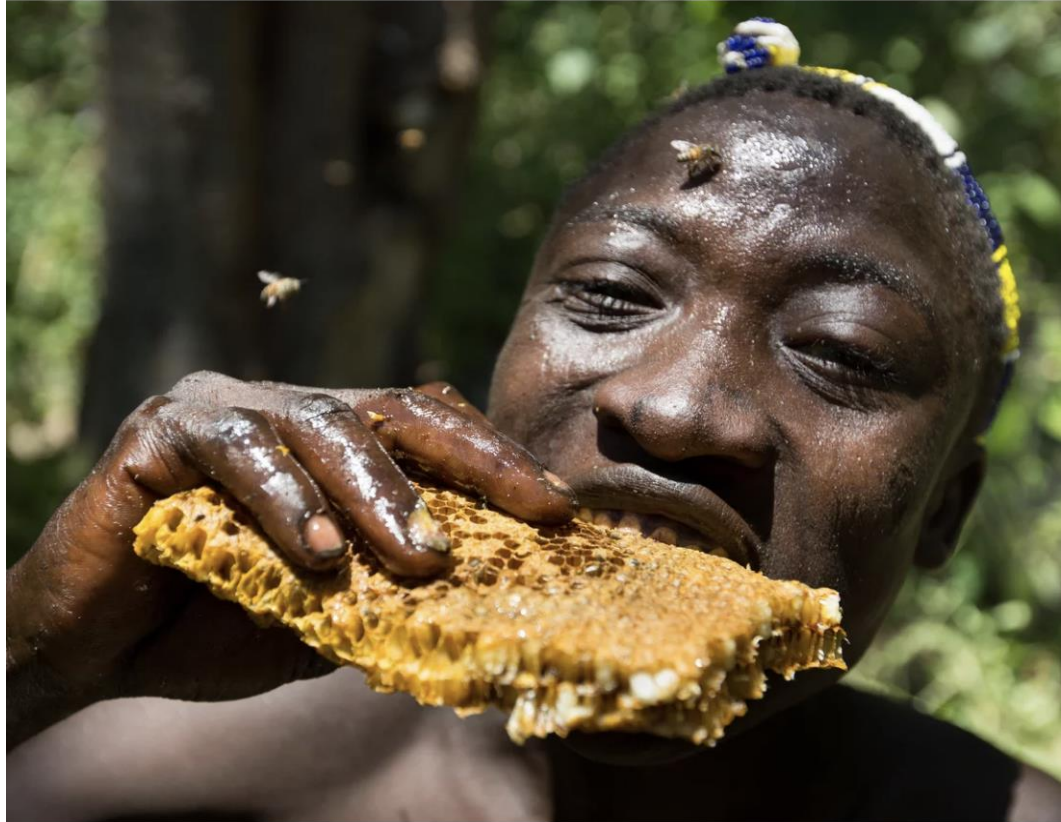
dza man eating honeycomb and larvae from a beehive.